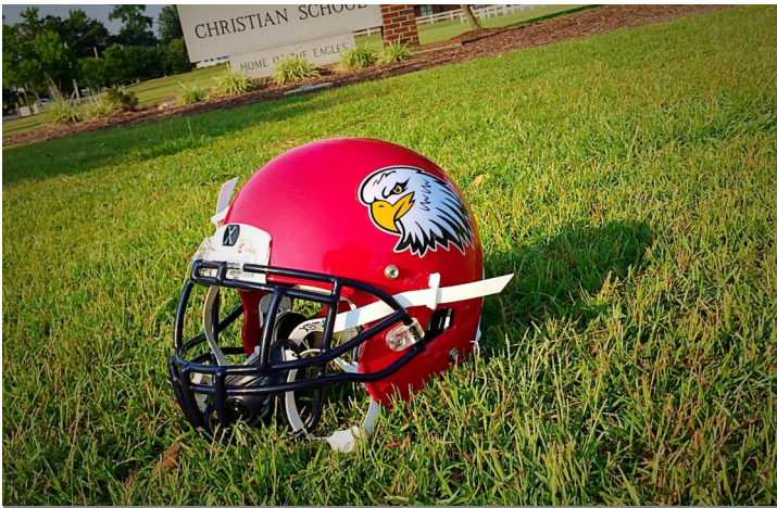
We proudly offer 15 sports for middle school and high school.